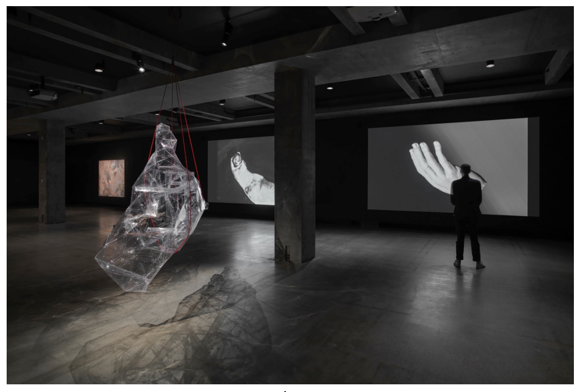
From left to right: Empty pond, The human engine and It'll soon be over (exquisite corpse).