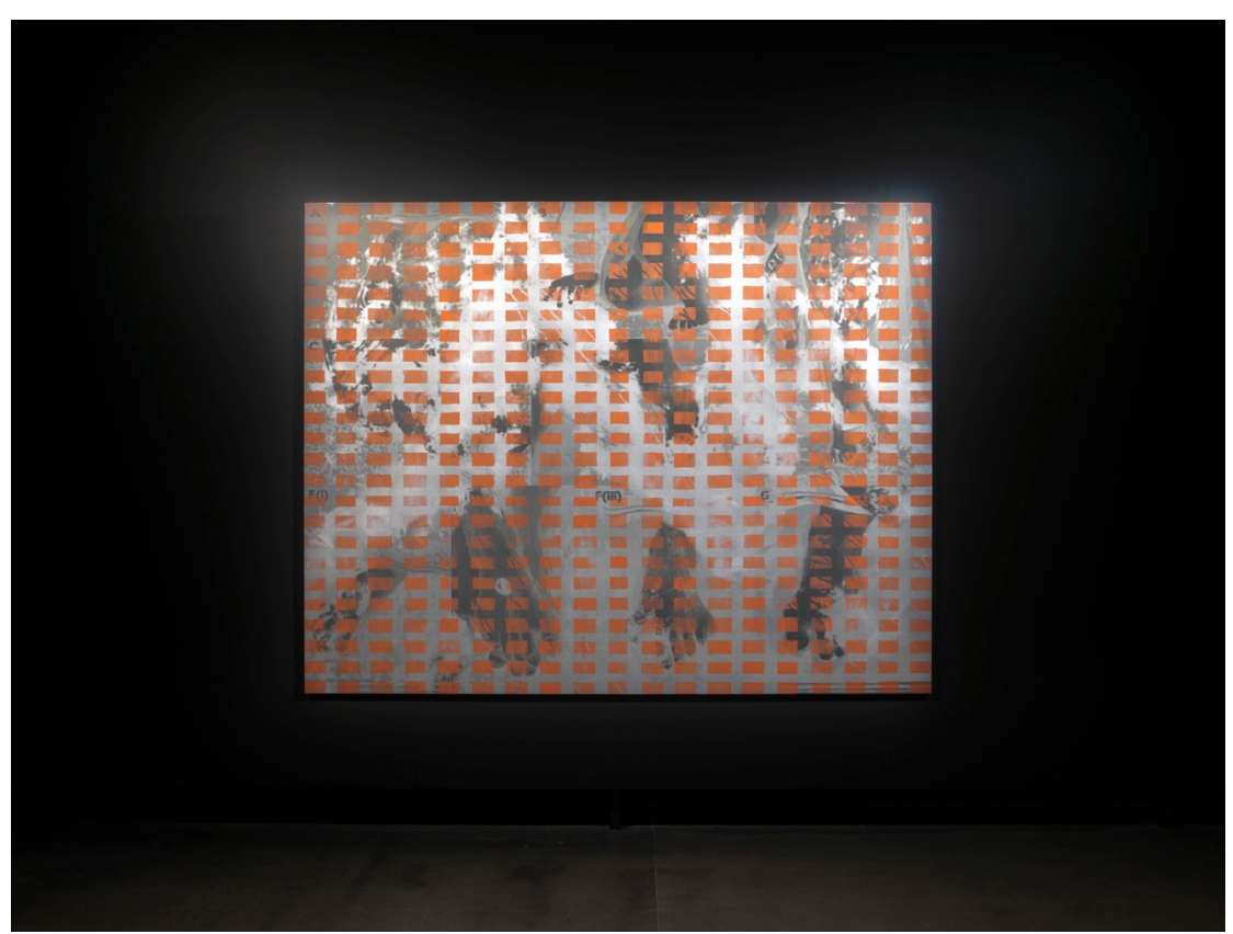
Toby Ziegler Agony party 2018 Oil on aluminium 200 x 255 x 4 cm