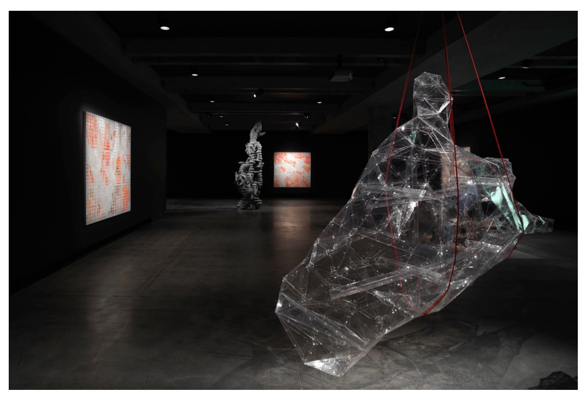
From left to right: The violet hour, Your shadow rising, Last Ray and The human engine.