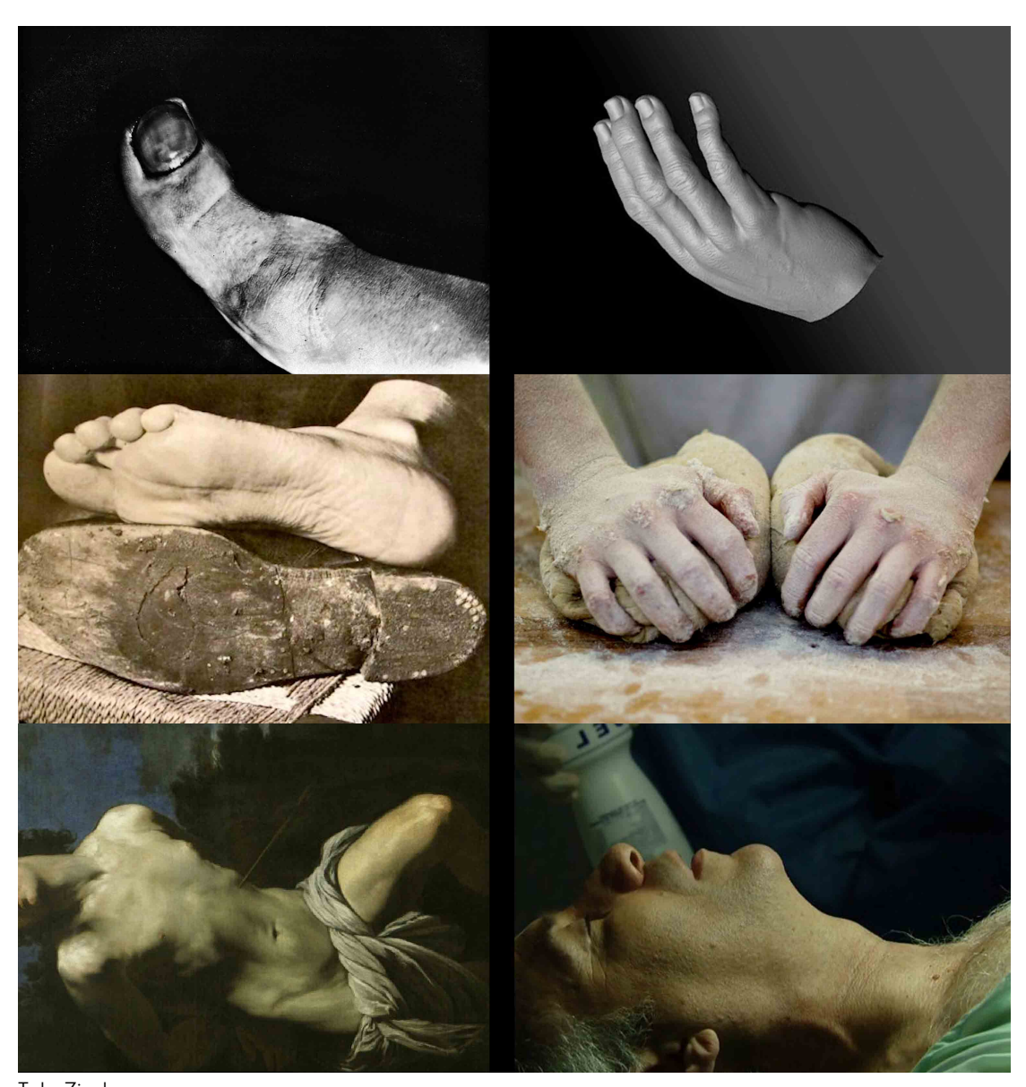
Toby Ziegler It'll soon be over (exquisite corpse) 2018 Two-channel video installation, colour, with sound; duration 00:04:55 looped