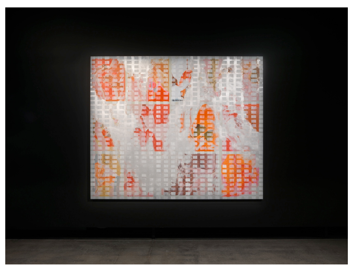
Toby Ziegler Last ray 2018 Oil on aluminium 200 x 241 x 4 cm