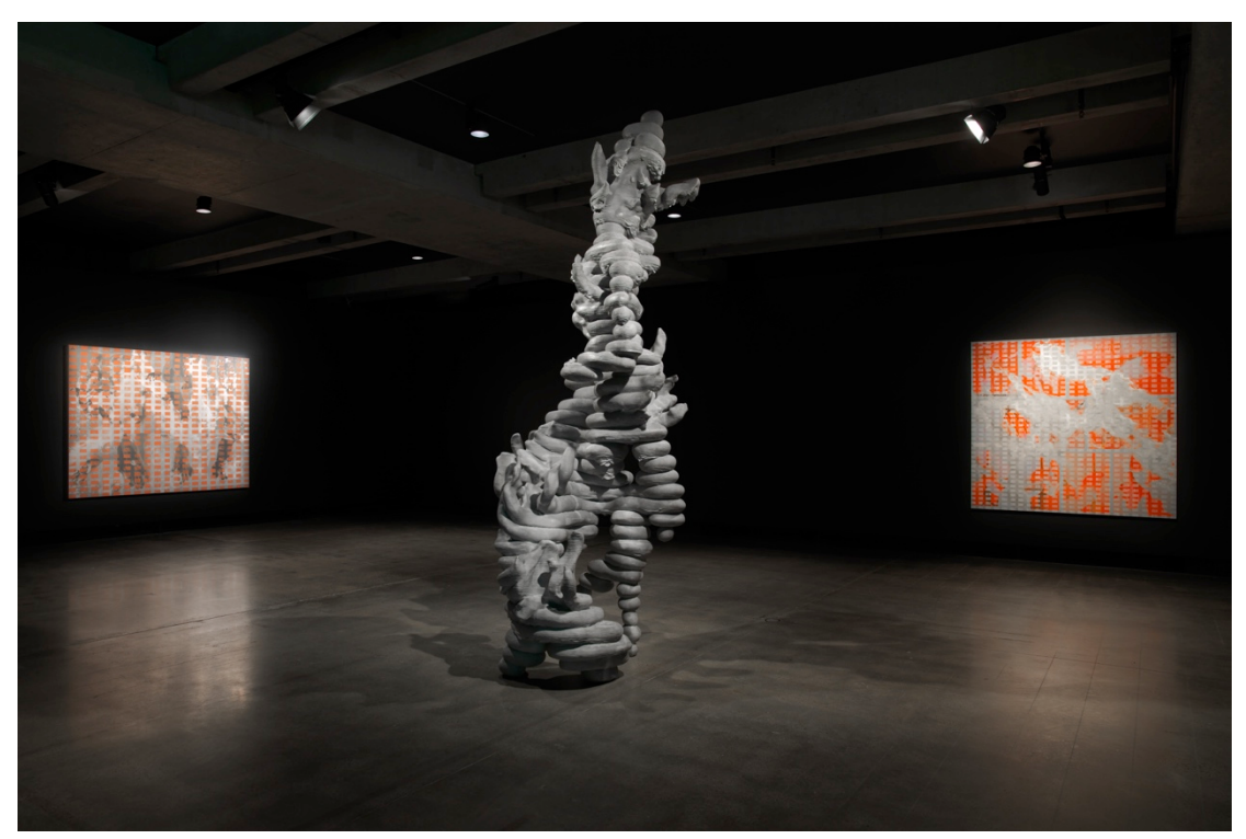
From left to right: Empty pond, Your shadow rising and The violet hour.