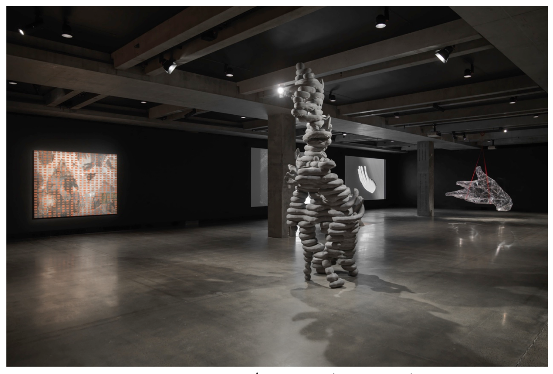
From \ left \ to \ right: \textit{Empty pond, Your shadow rising, It'll soon be over (exquisite corpse) and The human engine. } \\