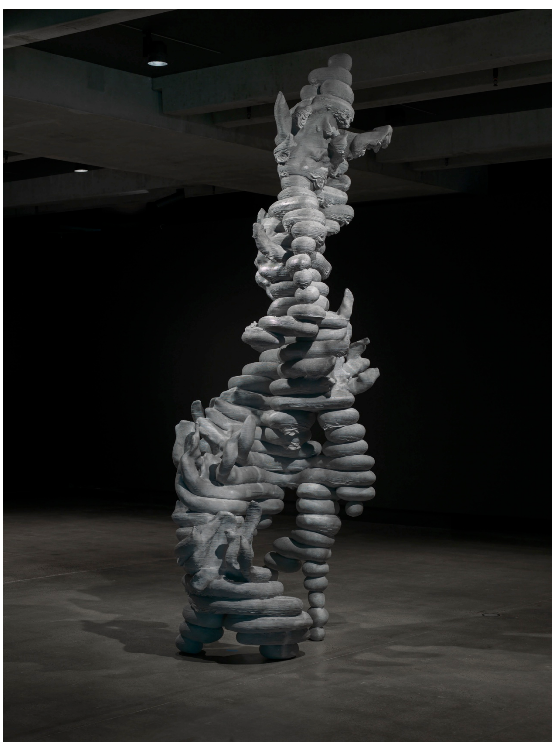
Toby Ziegler Your shadow rising 2018 Cast aluminium 370 x 170 x 128 cm