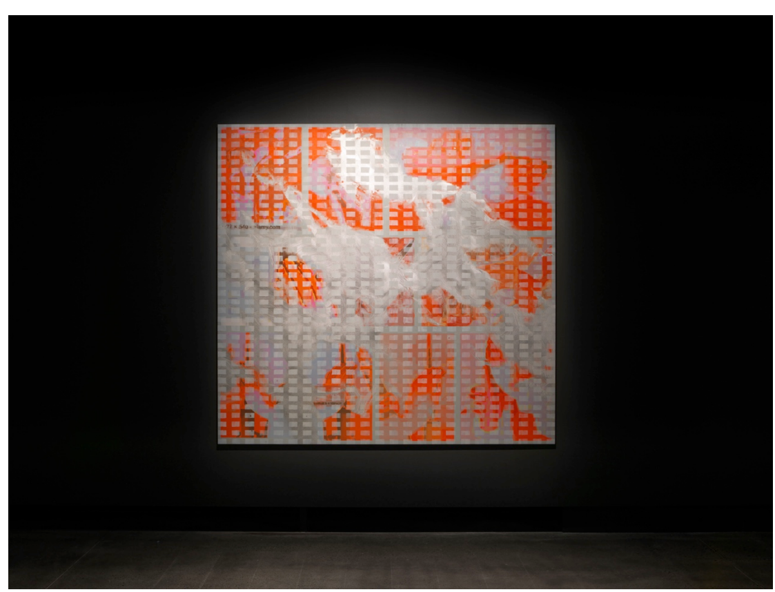
Toby Ziegler The violet hour 2018 Oil on aluminium 200 x 211 x 3 cm