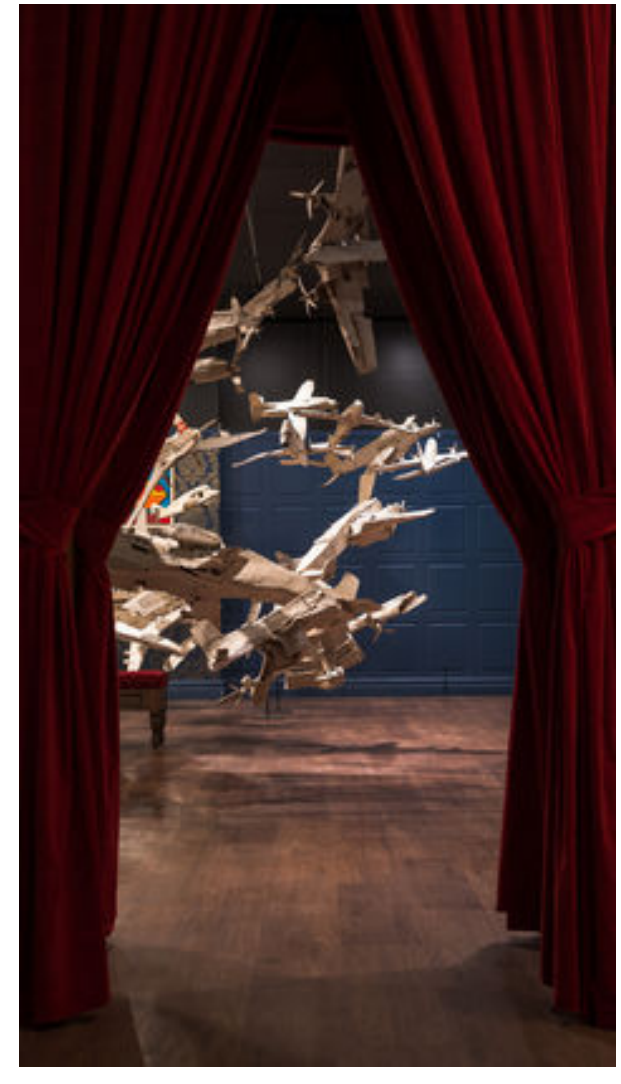
Untitled (all), Hans-Jörg Georgi, 2010–15, Courtesy of The Museum of Everything. Moorilla Gallery, CC BY

Which brings us back to those big questions: is it art, and should we be viewing it? Perhaps the best way to describe the individuals whose works fill the Museum of Everything is that they separately and as a group pose questions about the nature of art and challenge us to ponder what it means to be an artist. Significantly, through this process, they highlight the sense of our own humanity and showcase the qualities we ascribe to humanness. What could be more rewarding, inspiring and affirming?