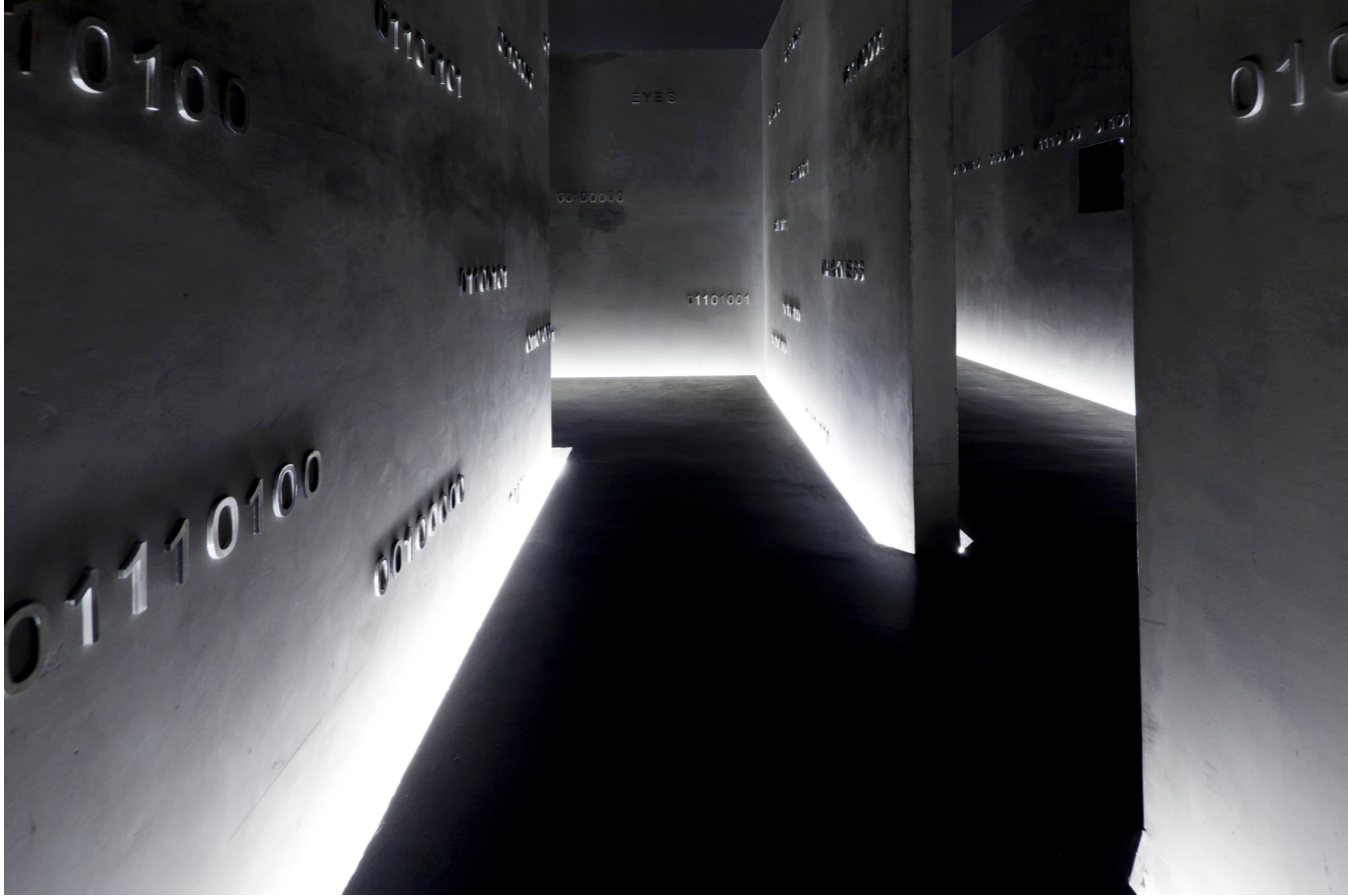
JAMES TURRELL, AMARNA (from the Skyspace series), 2015 © James Turrell, Photo: MONA/Rémi Chauvin, Courtesy MONA Museum of Old and New Art

(/exhibitions/david-walsh-museum-of-old-and-new-art-mona/image/cilnif4xg01ha1af7ivw2bbm1/brigita-ozolins-kryptos-2008-2010mona-museum-of-old-and-new-art-australia-numbers-way-alley-black-dark-walls)